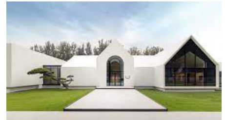
Song Art Museum