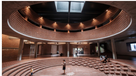
Red Brick Art Museum