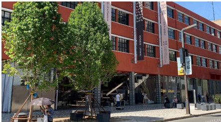
UCCA Center for Contemporary Art