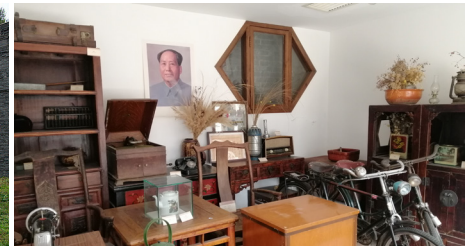
Dongsi Shijia Hutong Museum